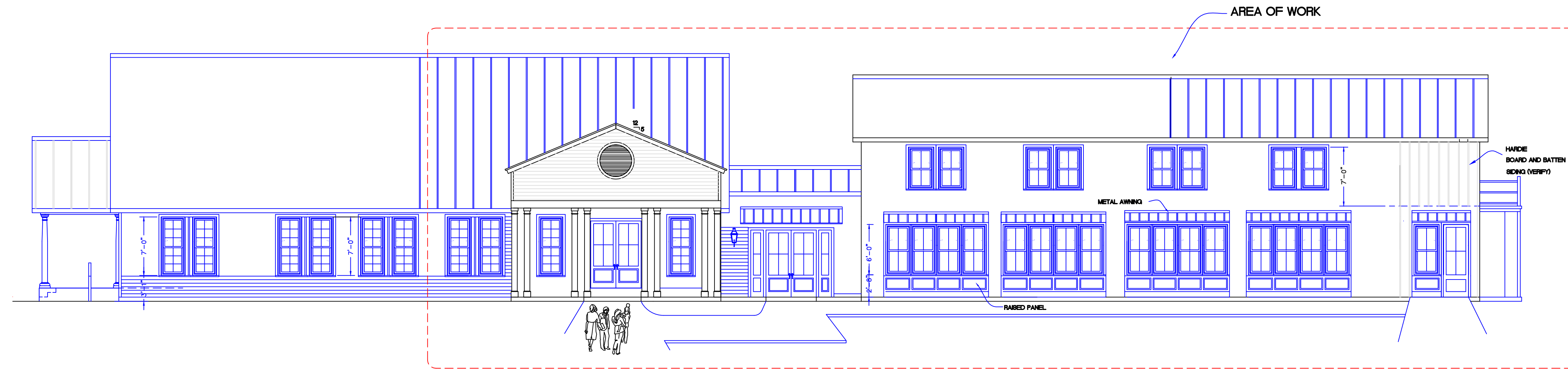
1. LIVE OAK SIDE ELEVATION 1/8" = 1'-0"