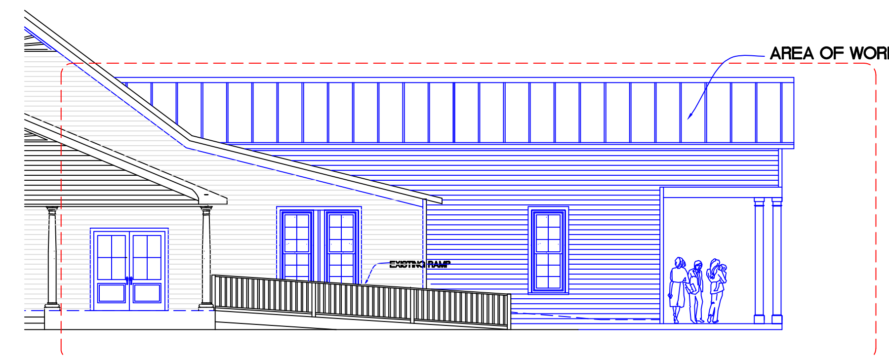
4. LEVEL STREET ELEVATION 1/8" = 1'-0"