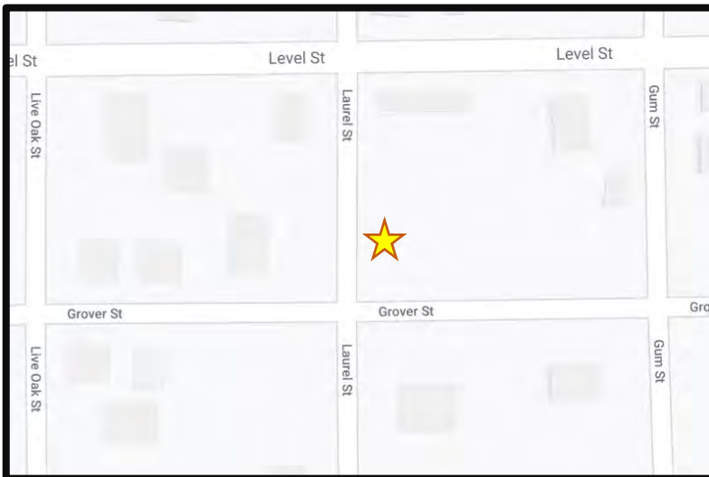
GOOGLE MAP LOCATION