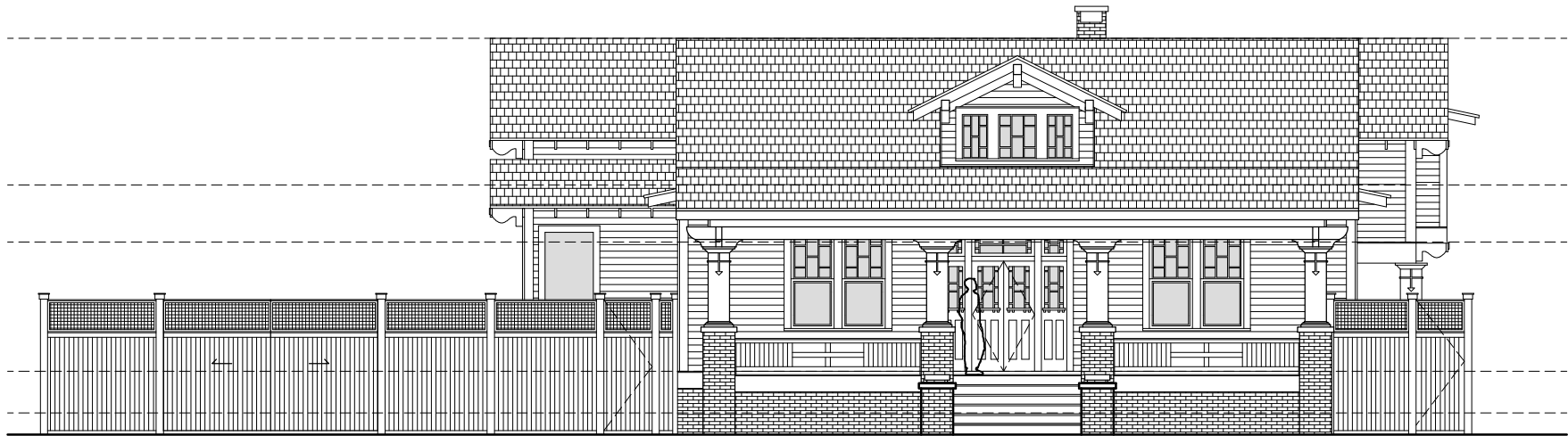
8' WOOD PRIVACY FENCE

OWNER INFORMATION: 22014 2ND STREET KELLY COLLEY 504-559-1682 KELLY.COLLEY@GMAIL.COM