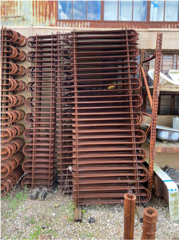
3'-4' HISTORIC IRON LOW FENCE

OWNER INFORMATION: 22014 2ND STREET KELLY COLLEY 504-559-1682 KELLY.COLLEY@GMAIL.COM