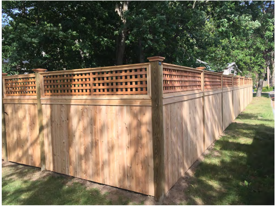
SIMILAR WOOD PRIVACY WITH LATTICE (FENCE SHOWN MAY NOT BE 8')