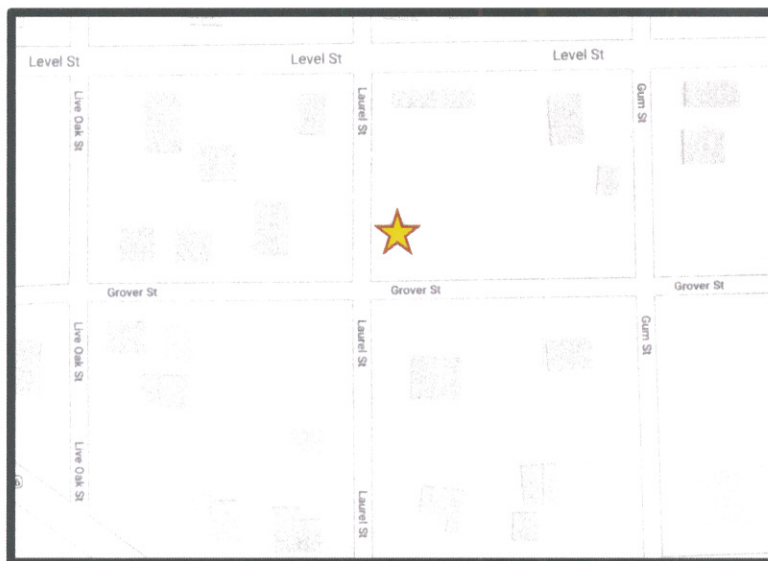
GOOGLE MAP LOCATION